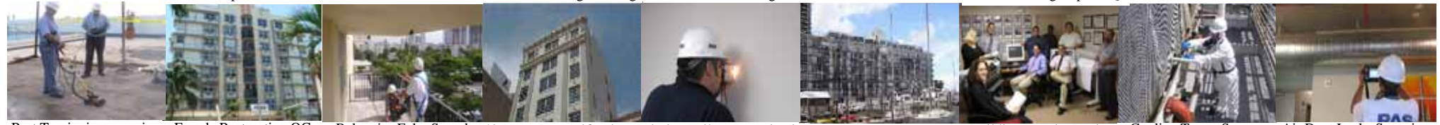
Post Tensioning scanning Facade Restoration QC Balconies Echo Sound 40-Years Recertification Painting Failure Investigation Damage Assessment Building Repairs Design Cooling Tower Survey Air Duct Leaks Scanning