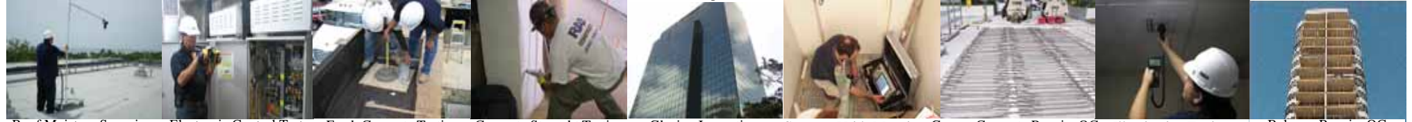
Roof Moisture Scanning Electronic Control Test Fresh Concrete Testing Concrete Strength Testing Glazing Inspection Concrete Voids Mapping Garage Concrete Repairs QC Illumination Testing Balcony Repairs QC