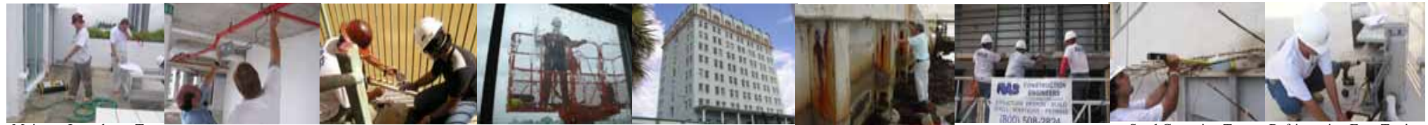
Moisture Impedance Test Fire Sprinklers Concrete ASR Test Windows Deluge Testing Historical Buildings Seawall Assessment Post-Tensioning Repairs QC Steel Corrosion Test Refrigeration Eqpt Testing