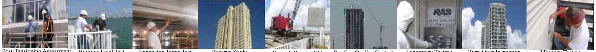
Post-Tensioning Assessment Railings Load Test Expansion Joints Test Reserve Study Seawall Repairs QC Roofing Quality Control Laboratory Testing Turn-Over Inspection Masonry Testing