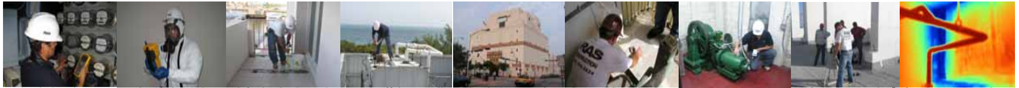
Electrical Testing Interior Air Contaminants Reinforcing Steel Mapping Energy Efficiency Audit Historical Preservation Concrete Corrosion Scan Sound and Vibration Test Roof Membrane Testing Infrared Thermal Imaging