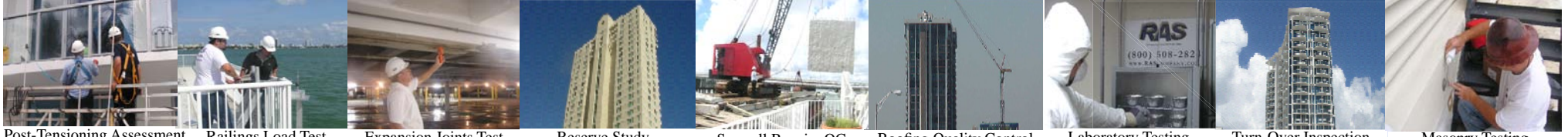
Post-Tensioning Assessment Railings Load Test Expansion Joints Test Reserve Study Seawall Repairs QC Roofing Quality Control Laboratory Testing Turn-Over Inspection Masonry Testing