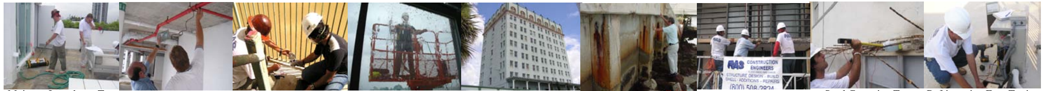
Moisture Impedance Test Fire Sprinklers Concrete ASR Test Windows Deluge Testing Historical Buildings Seawall Assessment Post-Tensioning Repairs QC Steel Corrosion Test Refrigeration Eqpt Testing