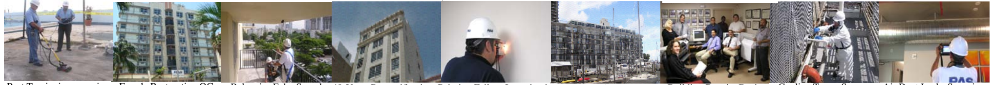
Post Tensioning scanning Facade Restoration QC Balconies Echo Sound 40-Years Recertification Painting Failure Investigation Damage Assessment Building Repairs Design Cooling Tower Survey Air Duct Leaks Scanning