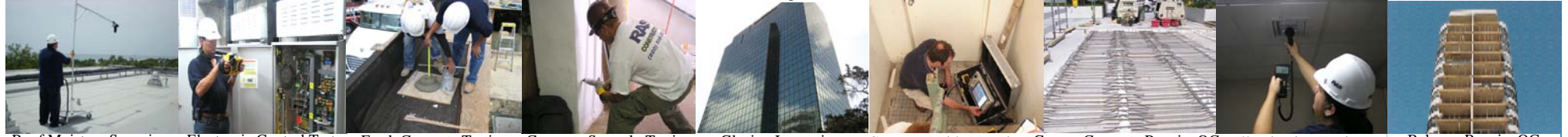
Roof Moisture Scanning Electronic Control Test Fresh Concrete Testing Concrete Strength Testing Glazing Inspection Concrete Voids Mapping Garage Concrete Repairs QC Illumination Testing Balcony Repairs QC