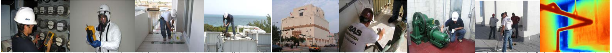
Electrical Testing Interior Air Contaminants Reinforcing Steel Mapping Energy Efficiency Audit Historical Preservation Concrete Corrosion Scan Sound and Vibration Test Roof Membrane Testing Infrared Thermal Imaging