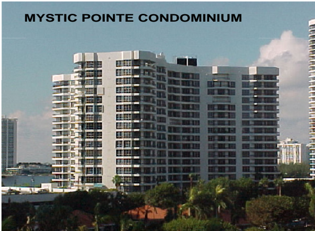
MYSTIC POINTE CONDOMINIUM

RAS COMMITMENT TO TESTING THE BUILDING FOR PERFORMANCE, PROVIDES ECONOMIC VALUE FOR THE OWNER BY INCREASING THE REPAIRS CYCLE, SPENDING LESS ENERGY, AND KEEPING TENANTS HEALTHY.